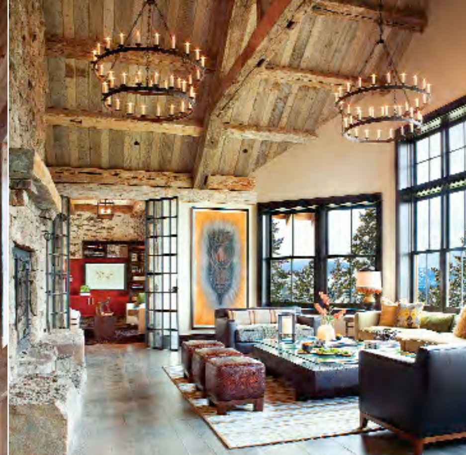
ABOVE: The home relies on typical Western materials, applied in both conventional and uncommon ways. The double-sided fireplace is made of Harlowton Stone from Montana. LEFT: The lounge takes the place of a formal dining room, which the owners felt they’d rarely use. The square iron tables were built by Custom II Manufacturing in Bozeman. BELOW: Embodying the home’s rustic-contemporary vibe, the chainmail chandelier was custom-made by CP Lighting in Milwaukee.